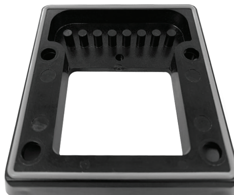
GASKET for electronic device