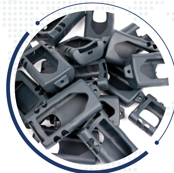
COVER made of silicone