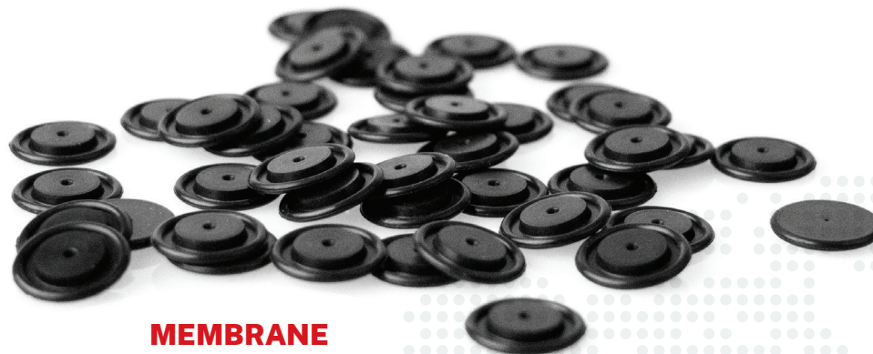
MEMBRANE made of EPDM rubber